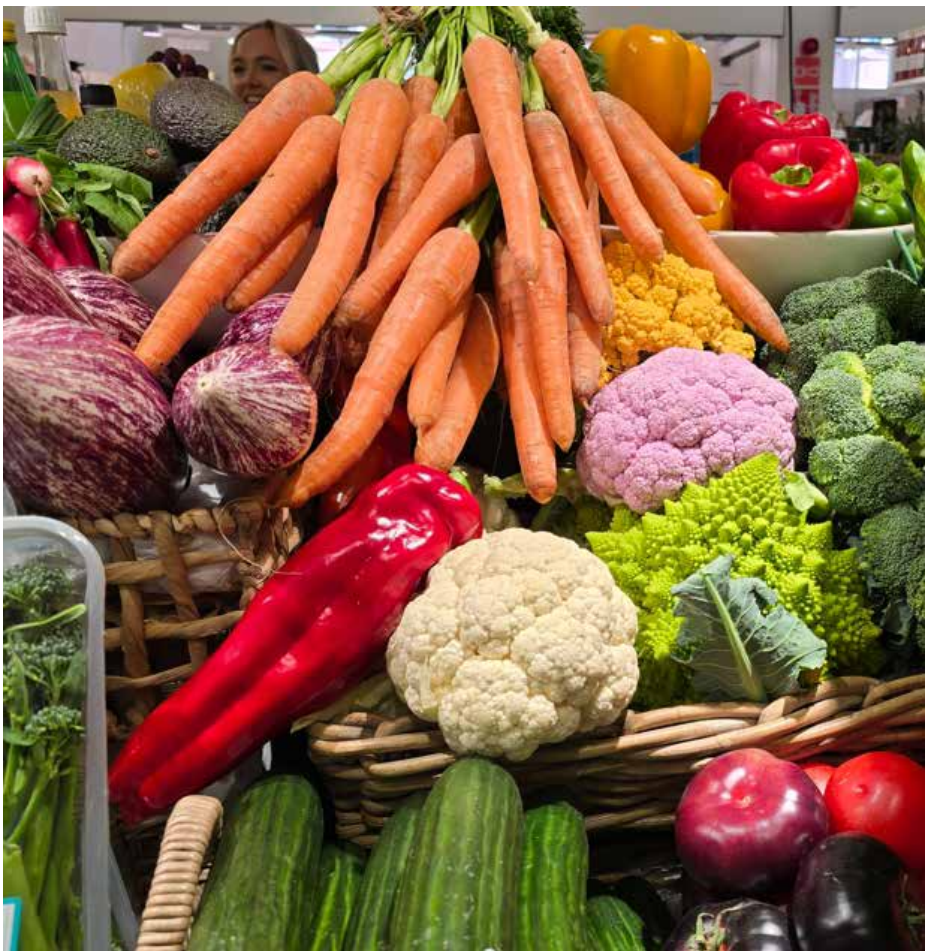
Eating healthy really isn't difficult.