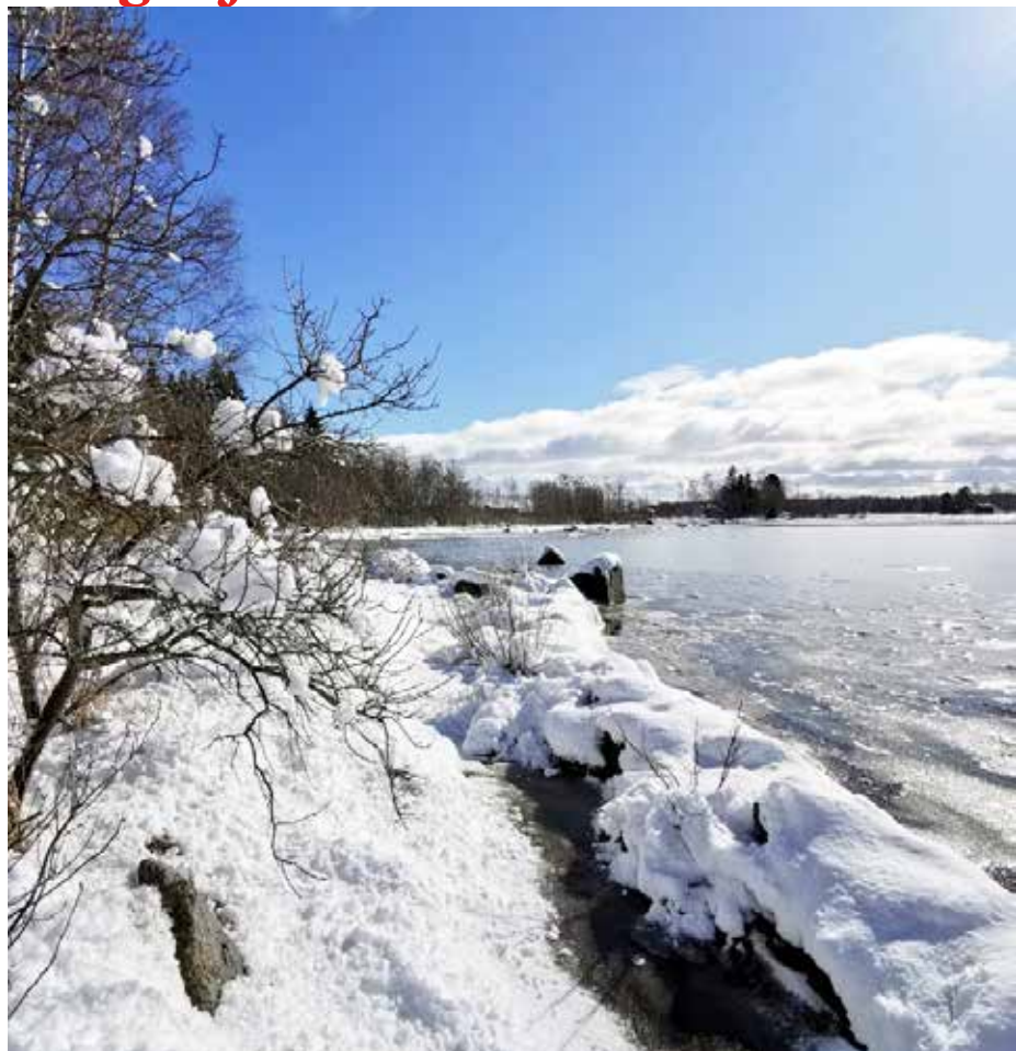
Winter has gone