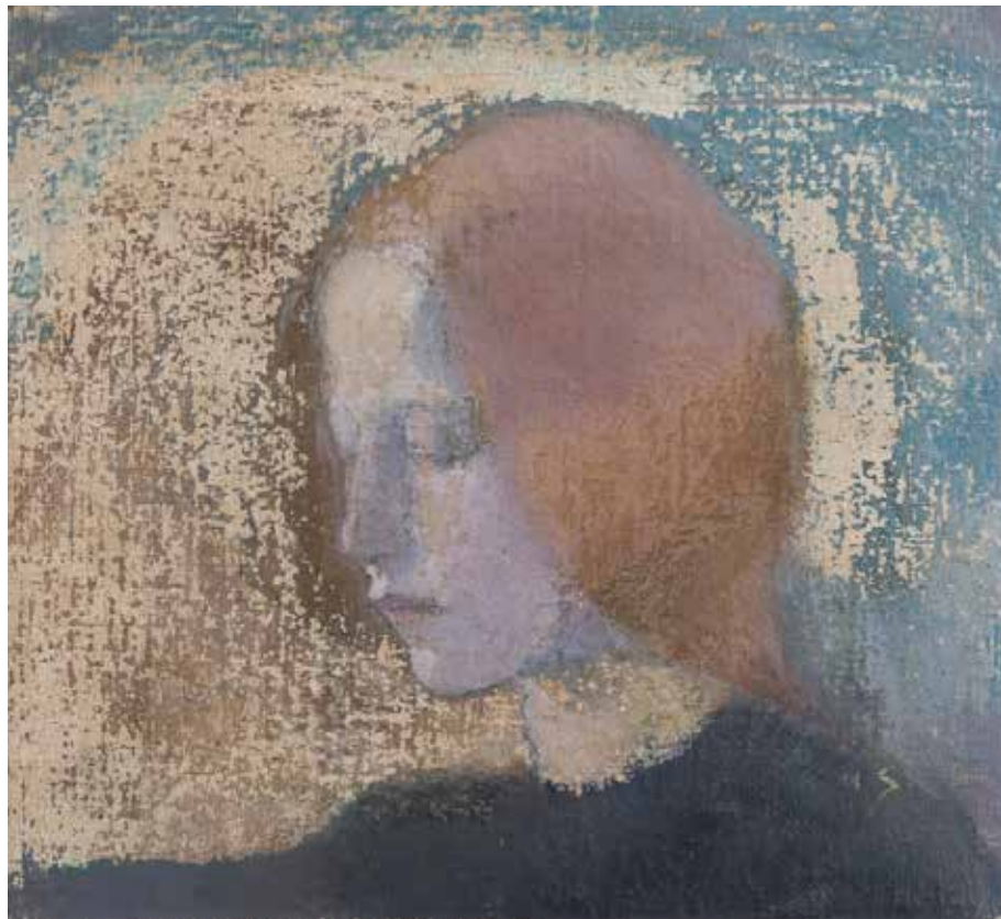
Helene Schjerfbeck, Fragment, 1904. Oil on canvas, 12 3/8 x 13 3/8 in. Villa Gyllenberg / Signe and Ane Gyllenberg Foundation, Helsinki

For Finnish art lovers, however, it is comforting that the works are now back home. But the question is: when will they show up in a Finnish hall? A decision is still missing.